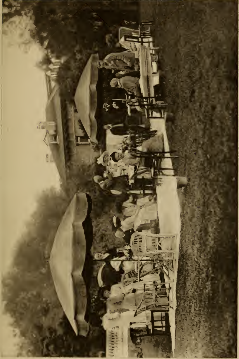
"LAWN PARTY" MISTLETOE COTTAGE